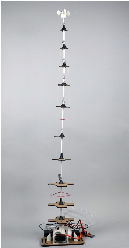
Figure 2: Overgrown 's endoskeleton in its neutral position. The central spine consisting of a bendable plastic rod with supporting discs is actuated by 4 servo motors adjusting tension of individual fishing lines.