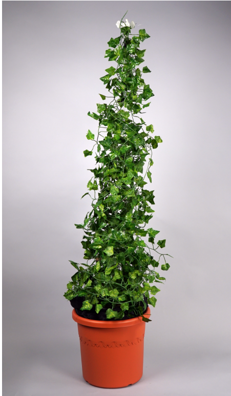
Figure 3: Overgrown 's skeleton “overgrown” with artificial ivy. By supporting plant growth, our concept aims for better integration into the environment while eliciting human empathy for living media.

they tend to draw the attention away from the user's task [13]. Designing appropriate notifications requires finding a balance between the detail of information and the alert level while maintaining an unobtrusive dialog. To support the user in their context, ambient notification systems aim for calm computing by informing the user of what is happening around them while not overburdening [12].