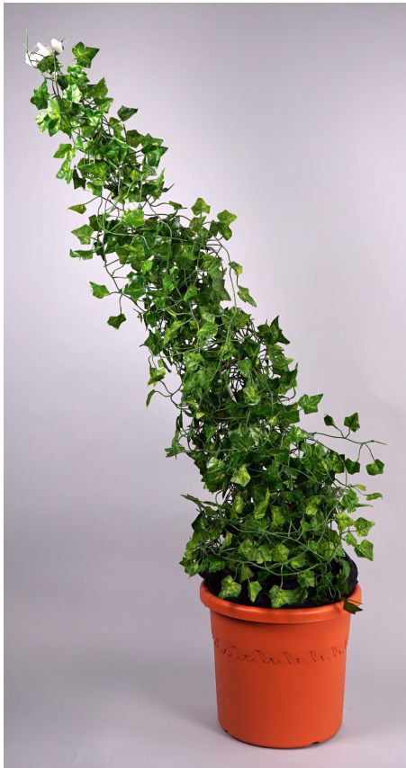
Figure 6: Overgrown in a bended configuration. Besides acting as a pointing motion, human affect for the plant would evoke contemplation for its wellbeing.